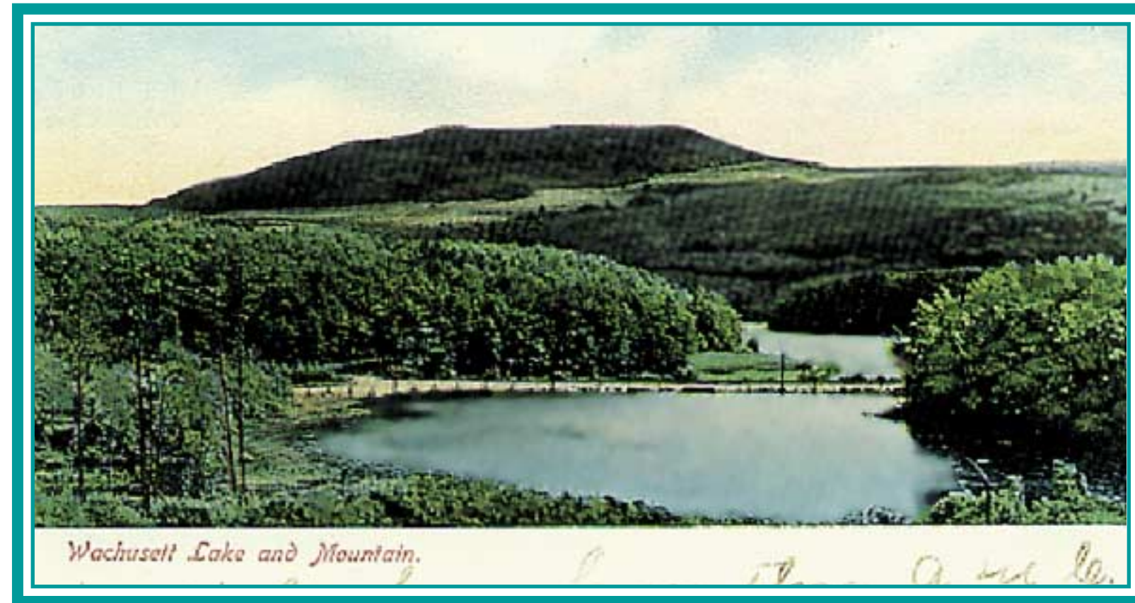
WACHUSETT LAKE (ELEVATION 887 FEET) LIES DIRECTLY NORTH AT THE BASE OF THE MOUNTAIN.