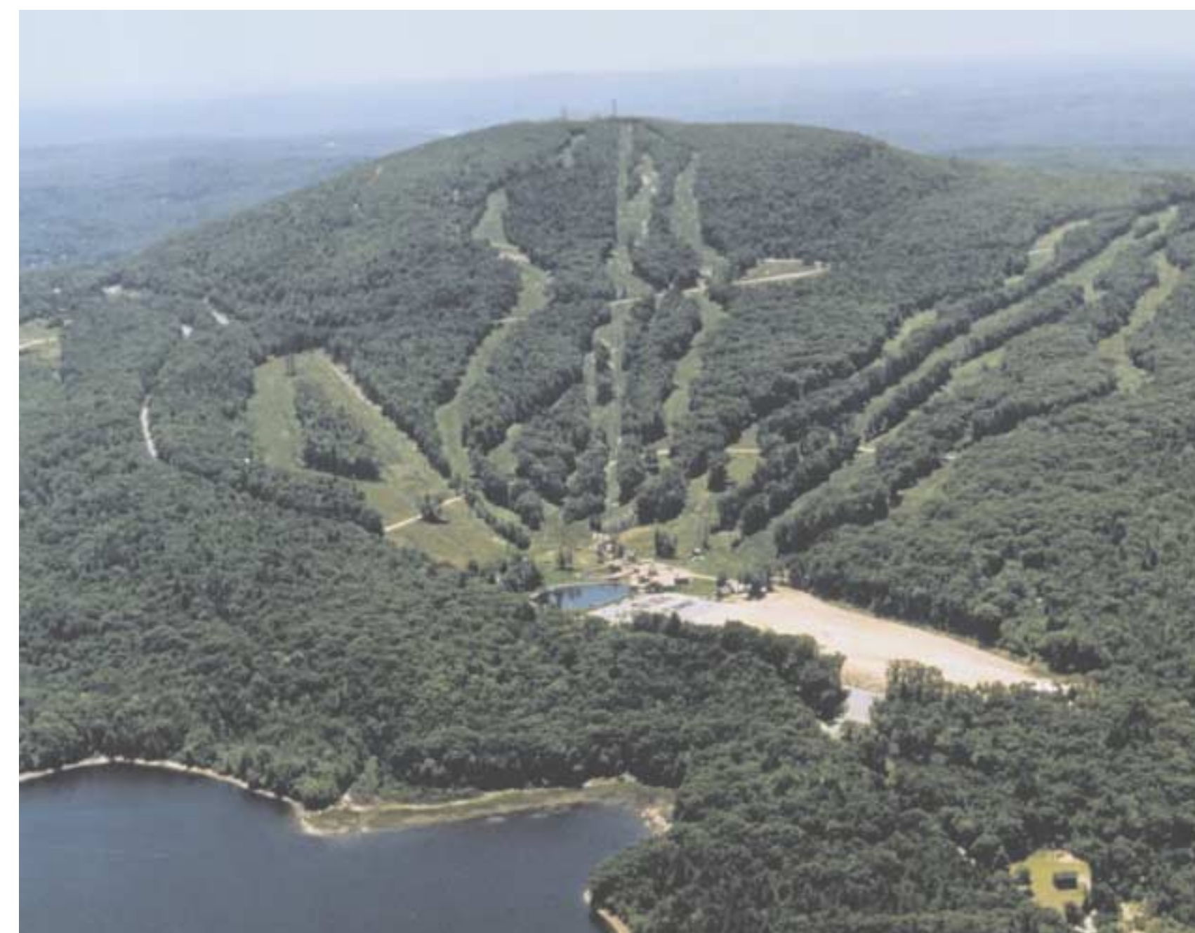
WACHUSETT MOUNTAIN IS IMPORTANT TO BOTH THE NASHUA AND CHICOPPE WATERSHEDS. WATER FROM THE MOUNTAIN FEEDS THE MANY PONDS IN THE AREA.

Our ski trails are part of the Nashua River watershed. Rain and snowmelt not used by plants or animals, that does not evaporate or seep into the ground, flows from the trails into channels which drain through a series of ponds and wetlands to Wachusett Lake or Wyman Pond. The water eventually flows to the Nashua River and finally the Atlantic Ocean. On the way the water is used for many different purposes by many communities, businesses, farms and private residents while providing habitat for countless plant and animal species.