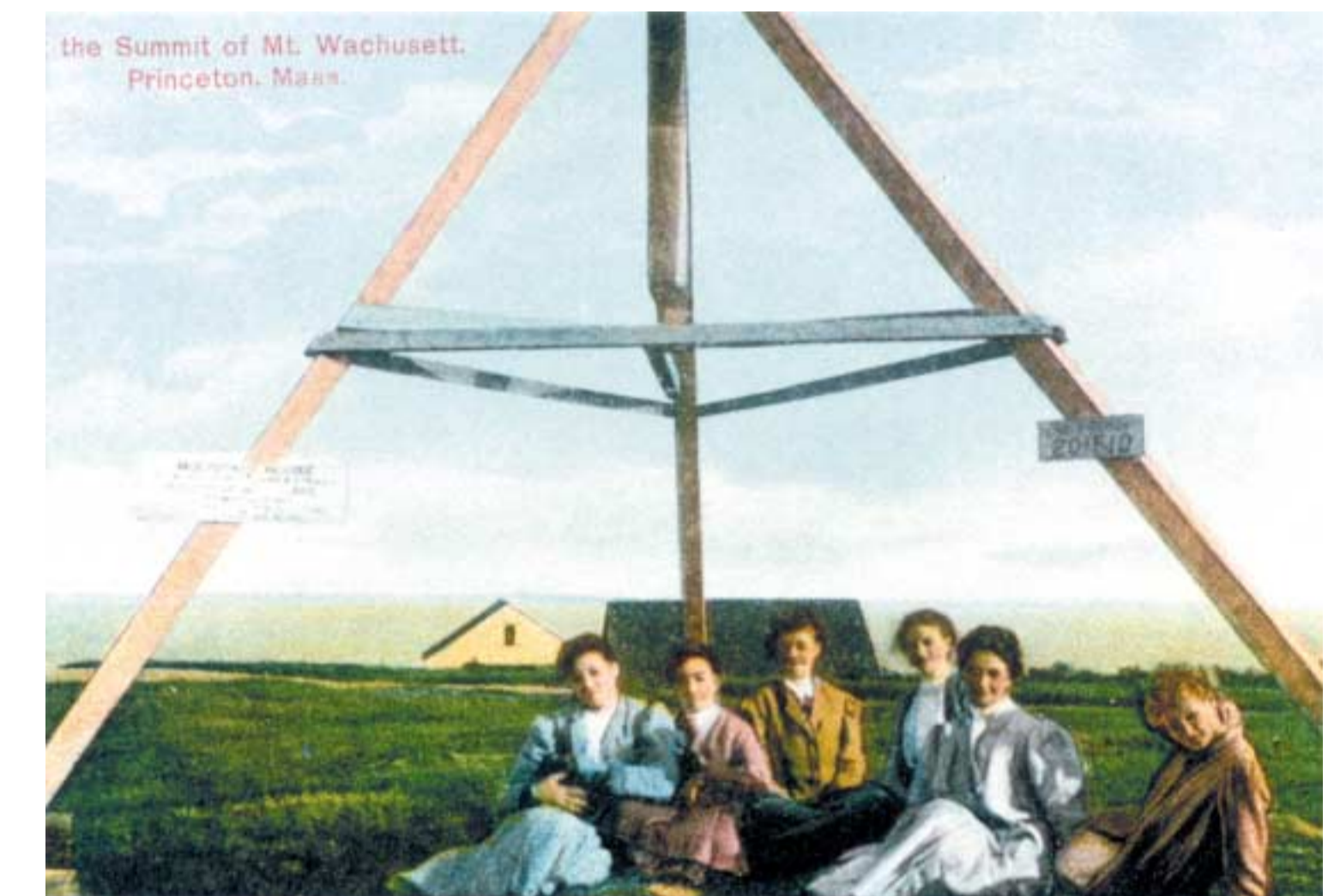
A GROUP OF WOMAN ON HOLIDAY ENJOY NATURE AT THE SUMMIT

Excursions to the summit evolved into week-long vacations as lodging and attractions developed on the rocky crown, and roads were improved.