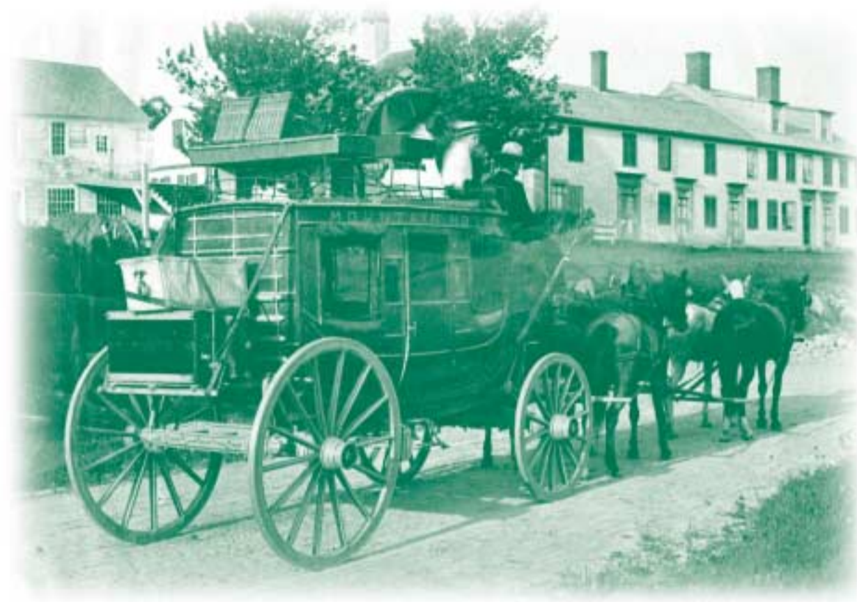
THE MORNING STAGE PICKS UP VACATIONERS AT THE DEPOT

Wachusett Mountain was very different in the 19th Century from the mostly wooded terrain that dominates today. The town of Princeton was a regular summer resort, with stage-coaches shuttling vacationers from the